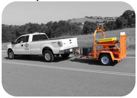
Quick and Safe Setup